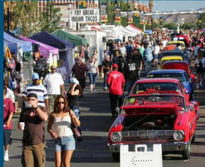
Annual attendance of 380,243 people for cultural and special events.