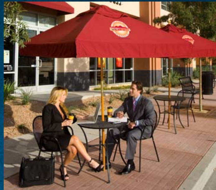
$12 Million invested by The Redevelopment Agency over the last 5 years.